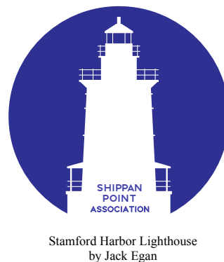
Stamford Harbor Lighthouse by Jack Egan

NON PROFIT US POSTAGE PAID WHITE PLAINS, NY PERMIT NO. 601